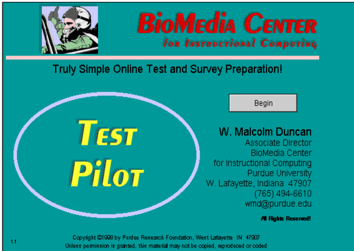
Figure 1. Test Pilot™ opening page.

Test Pilot™ was selected because, at the time, it was one of only a few authoring programs that could handle real time numerical computation. Test Pilot™ offered many other features that were deemed necessary for this project. For example Test Pilot™ supports most forms of web based media. This is not to say that Test Pilot™ is the only or best program on the market. It was the most attractive at the time this project was initiated.